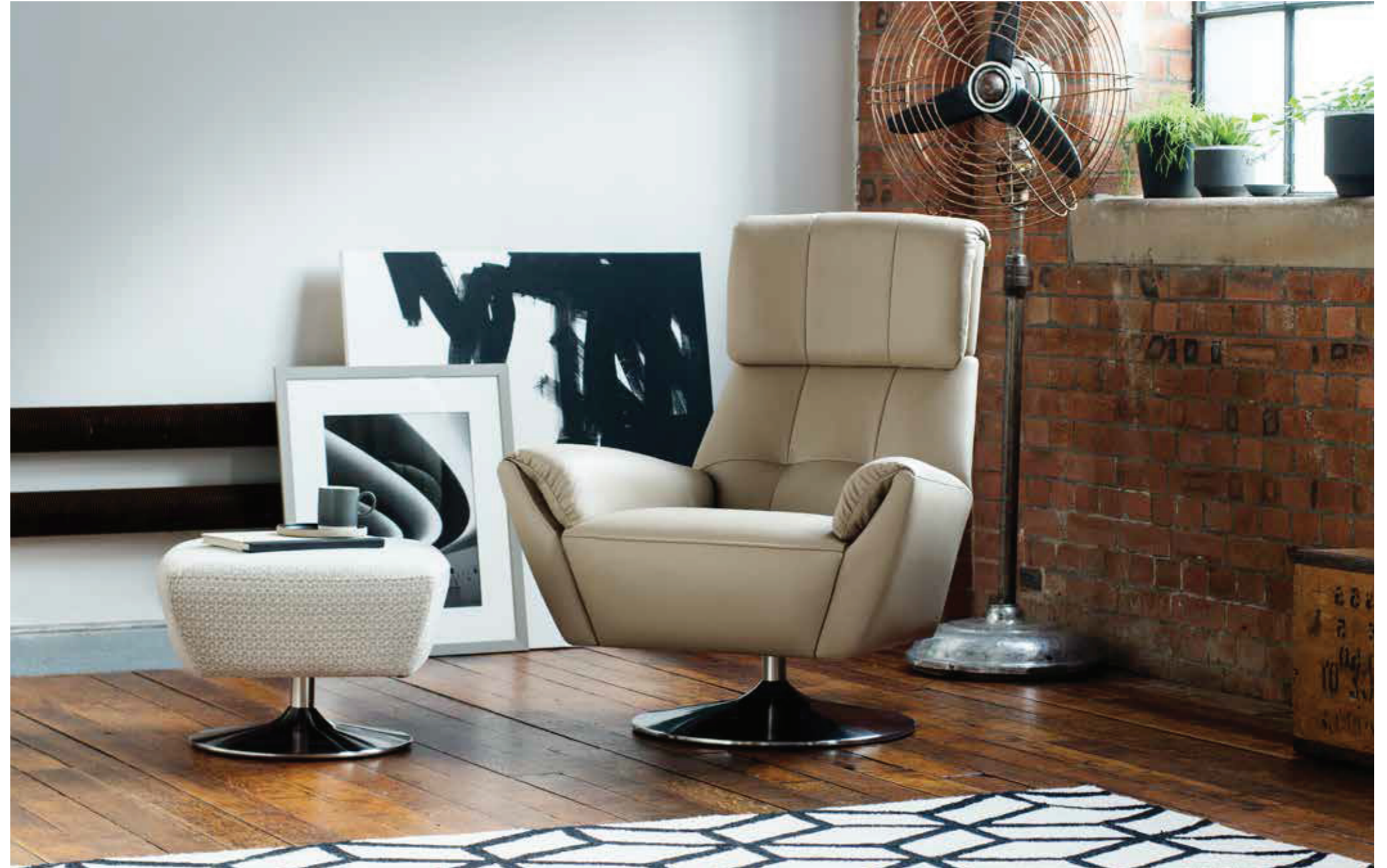
above: design 1703 leather chair in como taupe | below: design 1703 stool in abstract sable, design 1703 leather chair in como taupe