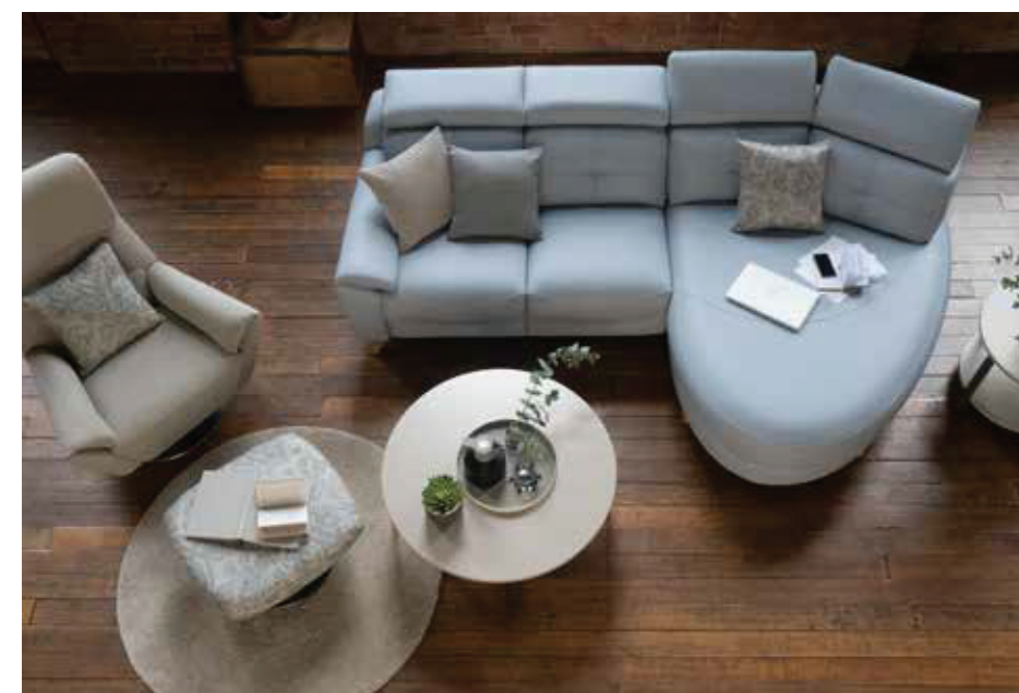
above: design 1702 leather power recliner chair in como slate | below: design 1702 leather chaise end sofa in como skye blue, scatters in pixel teal, abstract sable and herringbone slate, design 1703 chair in abstract sable, scatter and stool in pixel teal