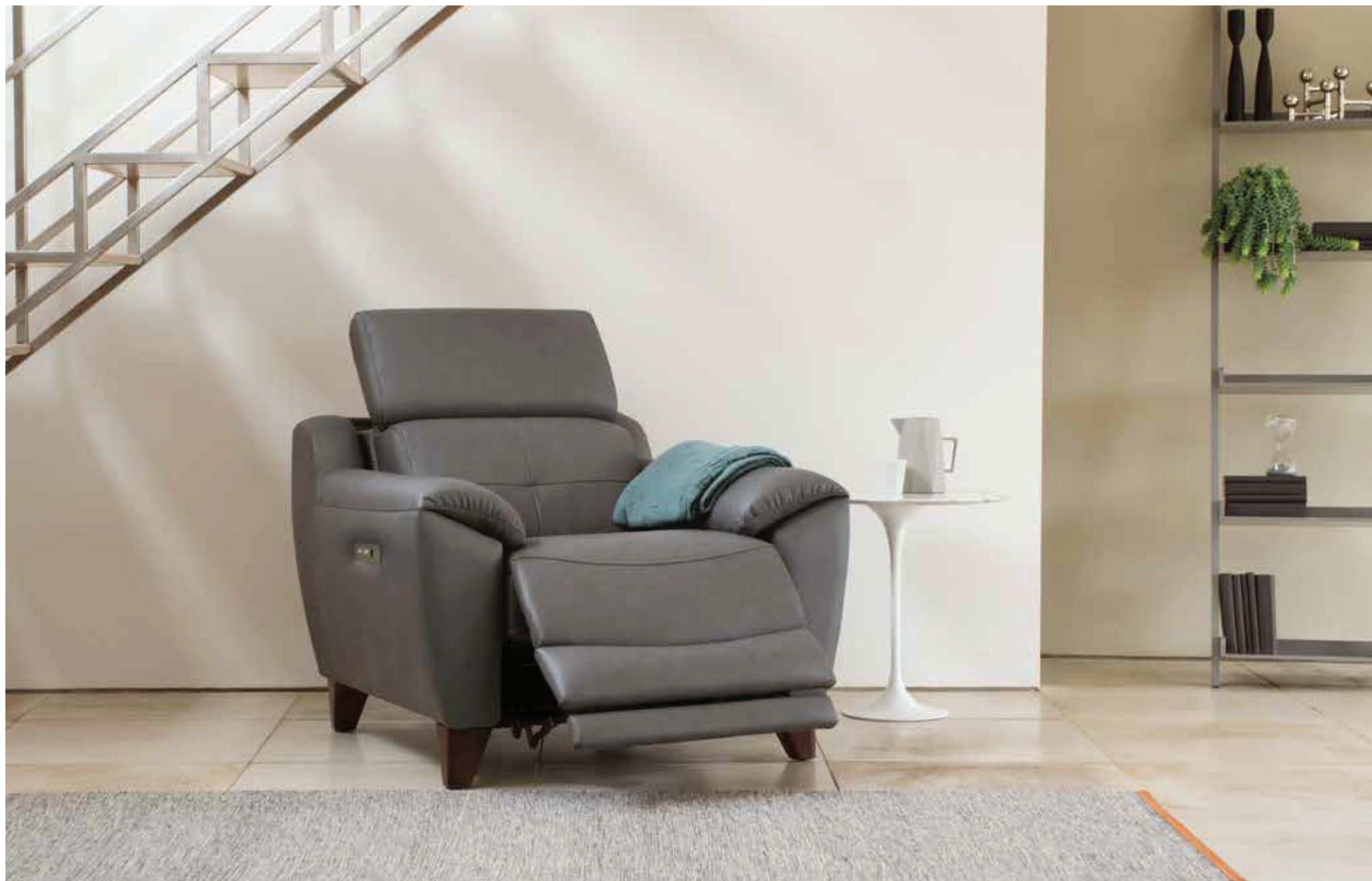
design 1702 leather power recliner chair in como slate

Design 1702's uniquely ergonomic design cradles the body, offering ultimate comfort, while adjustable headrests lift to provide additional support to the head and neck. The brushed chrome two button control for the power reclining mechanism transports you fluidly from upright to full recline at the touch of a button. In a first for Parker Knoll, the control conveniently houses a USB port for connecting your favourite devices.