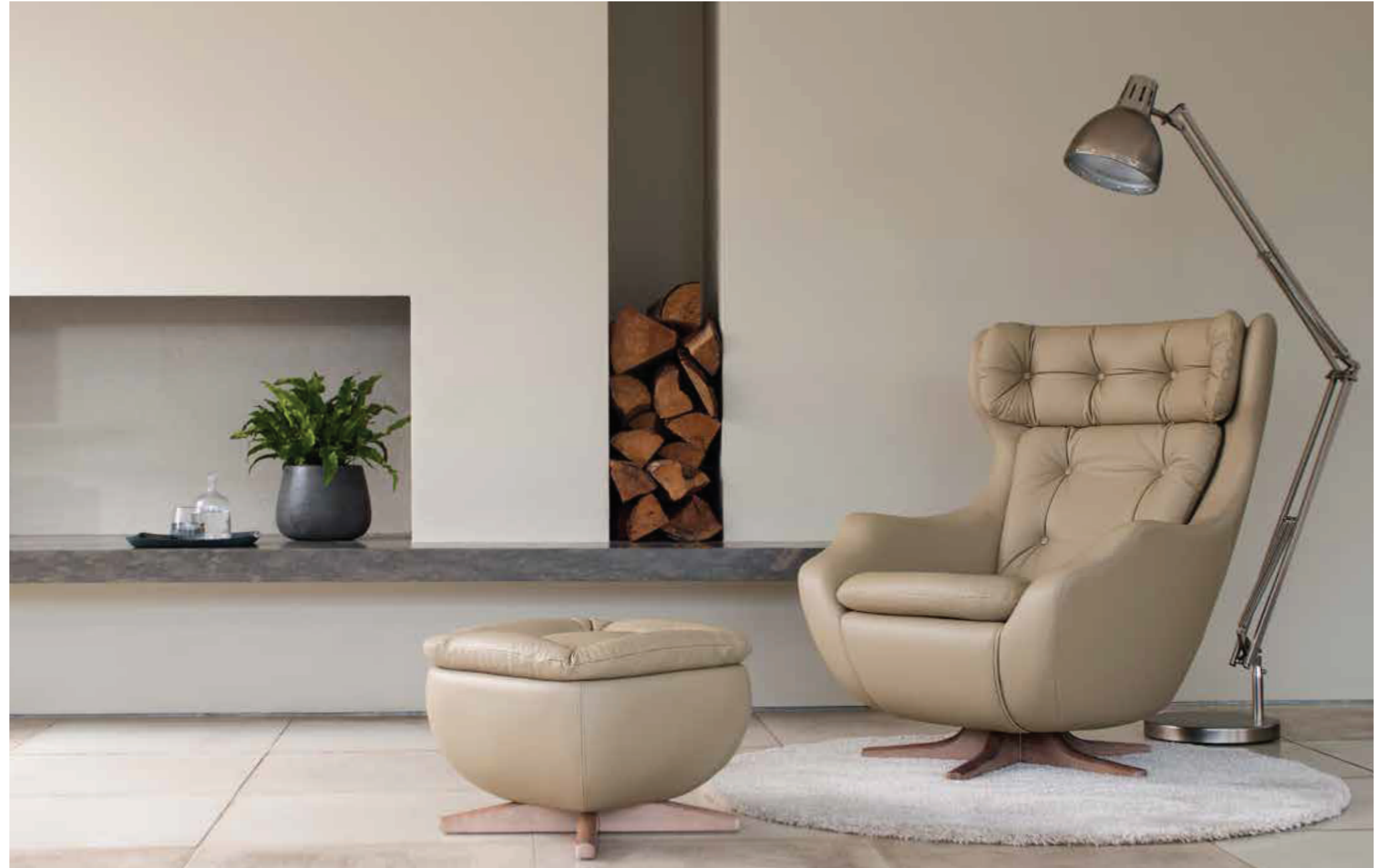
above: statesman chair in speckle sky | middle: statesman leather footstool in como taupe below: statesman leather chair in como slate